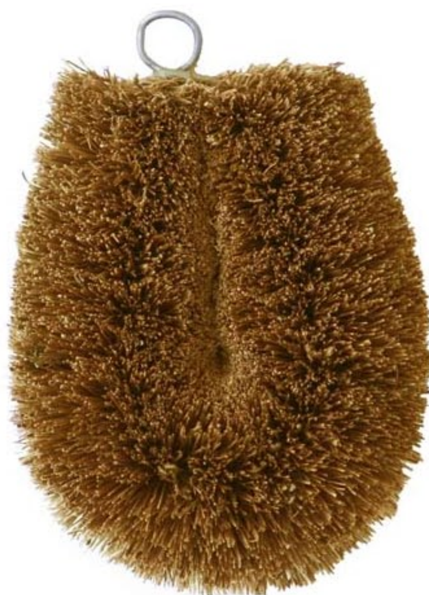
Above: Brush Tawashi Upi