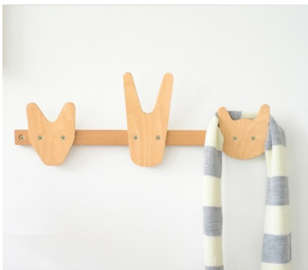
Top: Happy Chopper Above: Animals of Whittling Wood

New British design brand All Lovely Stuff are selling their wares a few doors down from our pop-up shop The Temporium in London.