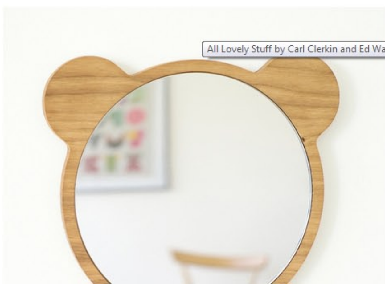
All Lovely Stuff by Carl Clerkin and Ed Ward

The All Lovely Stuff pop-up shop is open 10am-6pm daily until 24 December at 235 Brompton Road, SW3.